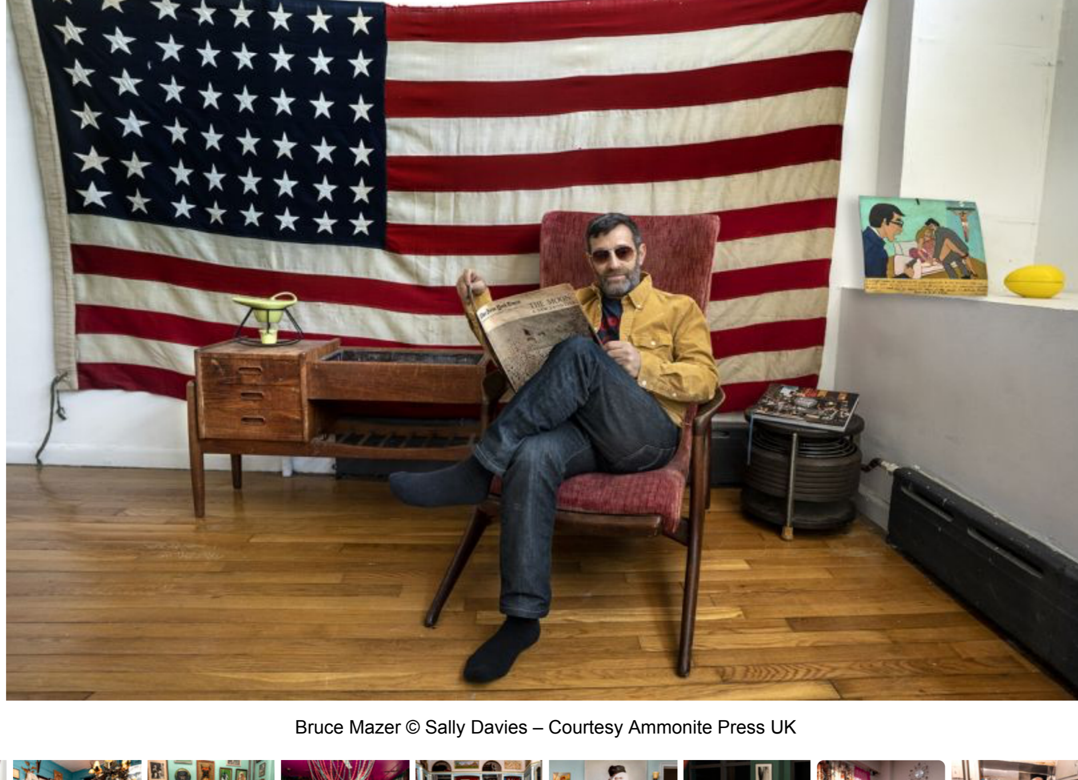
Bruce Mazer © Sally Davies – Courtesy Ammonite Press UK