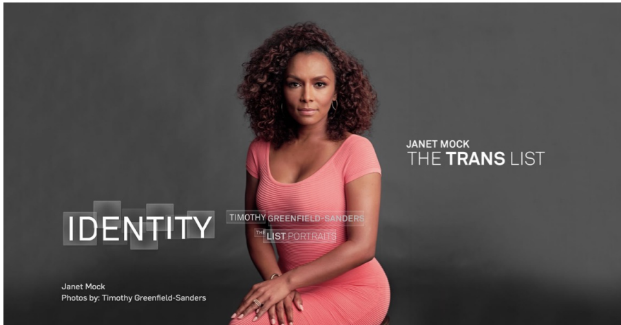
Janet Mock

Press: https://culturaldaily.com/identity-photographs-annenberg/